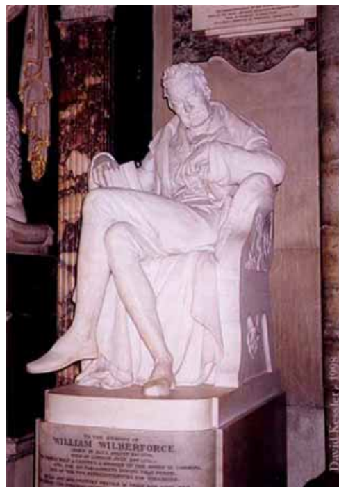
Wilberforce is honoured in Westminster Abbey, London, with this monument.

This counsel profoundly changed the course of British history. Wilberforce realised that the Word of God was not just for Christians, but for all mankind. This revelation would drastically grip Wilberforce for the rest of his political career and cause him to deserve some of the highest honours ever bestowed upon a person.